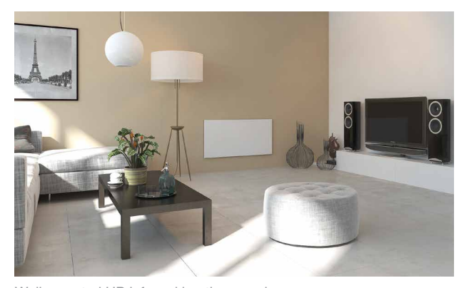
Wall mounted UB infrared heating panel