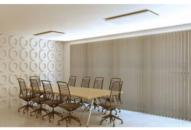
Ceiling mounted UB infrared panels